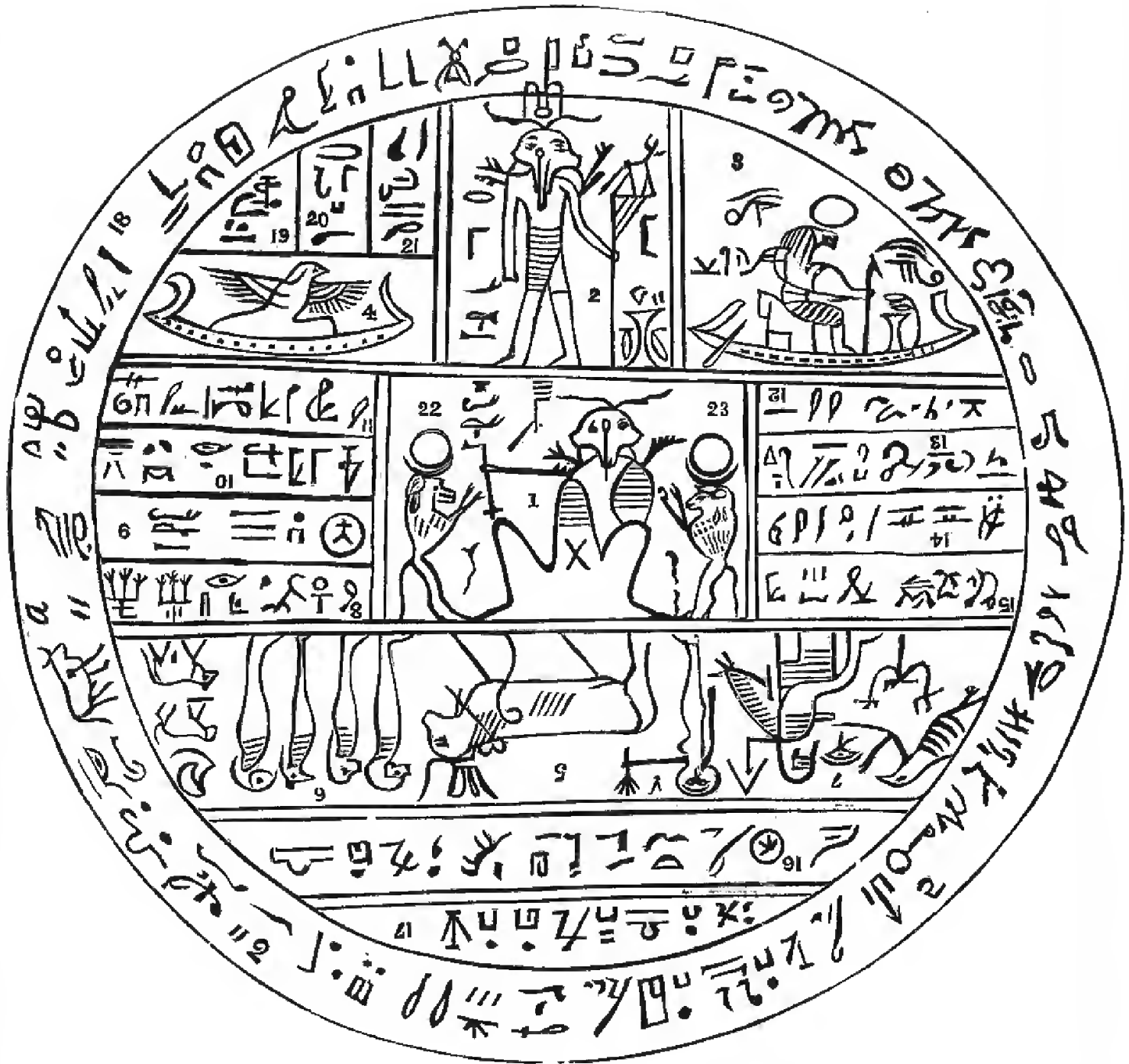
Fig. 1. Kolob, signifying the first creation, nearest to the celestial, or the residence of God. First in government, the last pertaining to the measurement of time. The measurement, according to celestial time; which, celestial time, signifies one day to a cubit. One day, in Kolob, is equal to a thousand years, according to the measurement of this earth, which is called by the Egyptians Jah-oh-eh.

Fig. 2. Stands next to Kolob, called by the Egyptians Oliblish, which is the next grand governing creation, near to the celestial or the place where God resides; holding the key of power also, pertaining to other planets; as revealed from God to Abraham, as he offered sacrifice upon an altar, which he had built unto the Lord.